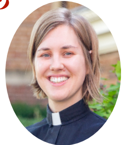
From the Pastor's Desk

As you may know, regularly during our Sunday morning worship we have a time for "mission moments" as well as "God sightings." Jesus has proclaimed that the kingdom of heaven has come near as we experience the work of the Holy Spirit in our communities today, through us! He sends us out to receive God's blessings and share God's blessings with a world in need. He promises that he lives through us to equip us to do this work.