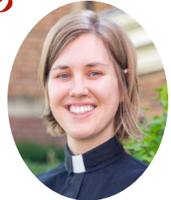
From the Pastor's Desk

I like the ending of John's gospel, because it's fun to think about what other things Jesus may have done that the gospel writer chose not to include in his book. Then, John reminds us that through our faith in Christ's resurrection, we have life in Jesus' name. We are God's Easter people! This is what it means to be Christian, to trust that Jesus' death and resurrection actually makes a difference for our lives today. It's great news that we have eternal life with God and get to go to heaven when we die, but how do we live like Jesus' resurrection matters in the meantime? Sometimes this question is harder to answer. "Living the Resurrection Life" will be our focus for our Easter season in worship this year.